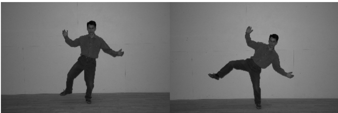
Figure 2: The “imbalanced equations” gesture.

Extending from the concept of balanced equations, there is the common student mistake of “imbalanced” equations – students often do not keep the two sides of the equation balanced while they are solving for the unknown. A new gesture for imbalanced equations has been developed to help students to circumnavigate this obstacle (). This gesture consists of (for example) the right hand going down, the left hand going up, leaning radically to the right, and hopping up and down on the right foot. The imbalanced equations are embodied by the off-balance person who is creating the visualization of imbalanced scales (see Figure 2).